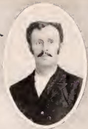
BAPTIST UNION CHURCH ALPHA, NEW JERSEY.